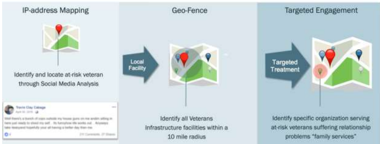
Figure 2. Phase II Engagement Activity